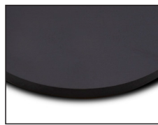
DARK BRONZE ANODIZED