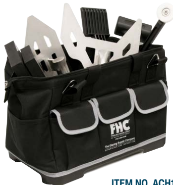
ITEM NO. ACH1K