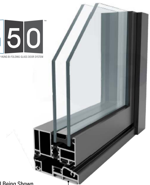
Low Profile Sill Being Shown, High Profile Sill Also Available