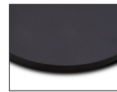
DARK BRONZE ANODIZED

* Only Available for Item No. 24LH and 48 LH