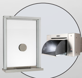
Transaction Windows & Drawers