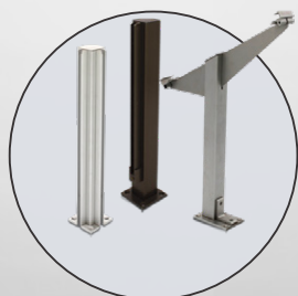
Diack Partition Post